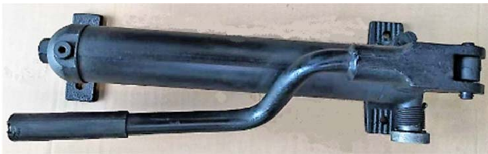
Old pump SP06-9100G

Please review below for visual comparison: