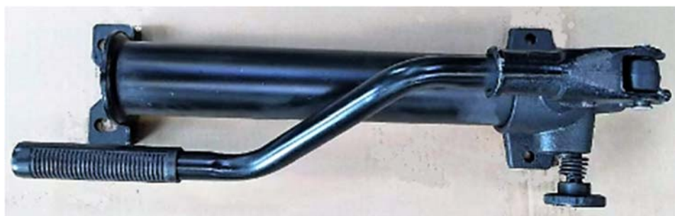
New pump LY06-9100G

Please note the new pump has been implemented as running change and is a direct replacement for the original pump.